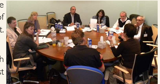
The judges at work